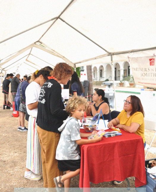
HOUSING SANTA BARBARA DAY