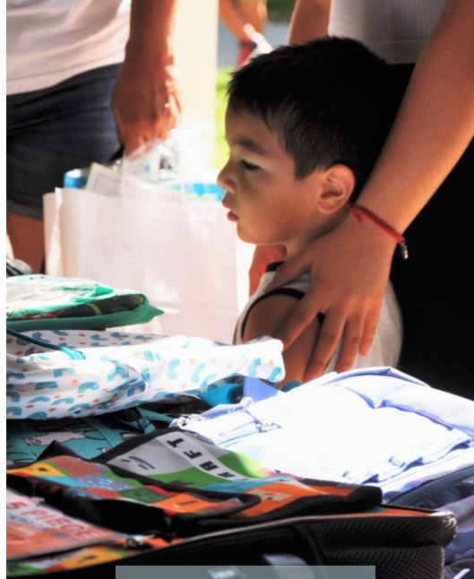
TOOLS FOR SCHOOL